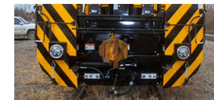
Optional - Slide Hitch (shown) Standard - Draft Gear Coupling