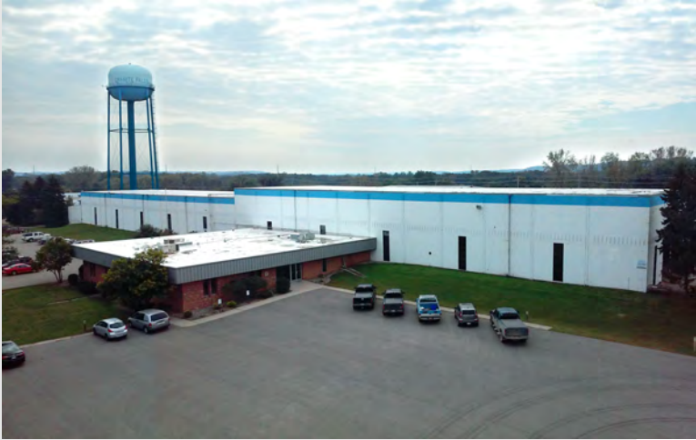
New Ulm, MN